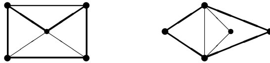
Figure 2. The graph on the left is not ECE; the graph on the right is ECE.

Every acyclic graph G is trivially ECE, as is G = C_n for every n \geq 3 . The house graph is not ECE, since its 3-cycle is almost contained in the 5-cycle, but not in a 4-cycle. The graph on the left in Figure 2 is not ECE (take C to be the top triangle and C^+ to be the 5-cycle that contains two edges of C and three peripheral edges), but the graph on the right is ECE.